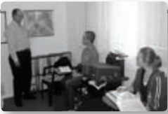
Classes at TBS

For Christians, training the next generation begins in the home.